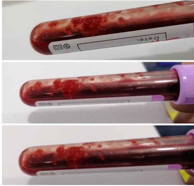
Figure 1: The EDTA tube of the patient.

Subsequently, the x-ray was obtained for the patient as shown in Figure (2), showing the