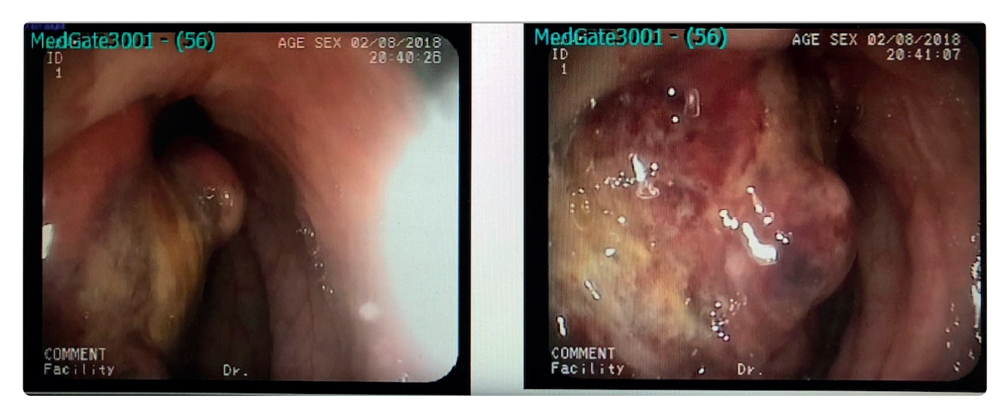
Fig. 2. A 5x6 cm mass lesion in the transverse colon

A 9-year old female patient referred to hospital with abdominal distension. The patient was told she had gas and left without treatment. The complaints continued and increased at follow-up, and she referred to the department of gastroenterology, where a USG revealed a hypoechoic solid mass lesion on the adnexal sides. The patient was consulted to pediatric hematology-oncolgy departemnt for the suspected ovarian mass. The patient had undergone a liver transplantation with a diagnosis of progressive familial intrahepatic cholestasis when she was 6.5 months old. There was a massive pleural effusion on the left side, found on thoracic CT, a solid cystic mass in the right and left adnexal areas, and acid in the abdomen upon an abdominal CT (Fig. 3). Alpha-fetoprotein, and beta-HCG were normal and CA125 was 1088.4 U/mL (0-35). The patient was diagnosed as BL according to the biopsy findings. For the patient at stage III, the LMB-96 treatment protocol was initiated. The treatment of the patient has comple-