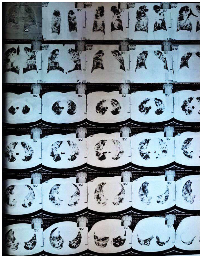
Figure 2: The Chest CT for the patient

After these findings, a swab from the nasal cavity internally was taken and sent for PCR. The results came with positive COVID-19 disease and she admitted that she had suffered from Fever and dyspnea in the last seven days with severe headache that controlled with Paracetamol pills three times a day and usually more than three times.