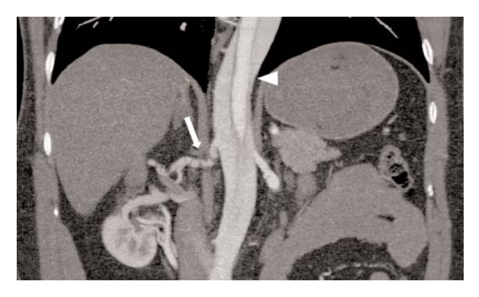
Figure 1. Coronal maximum intensity projection (MIP) CT image shows the stenosis of right renal artery ( arrow ). Note the dissection of aorta ( arrowhead ).

The clinical importance of this variation is the potential of causing renal artery entrapment which is an infrequent