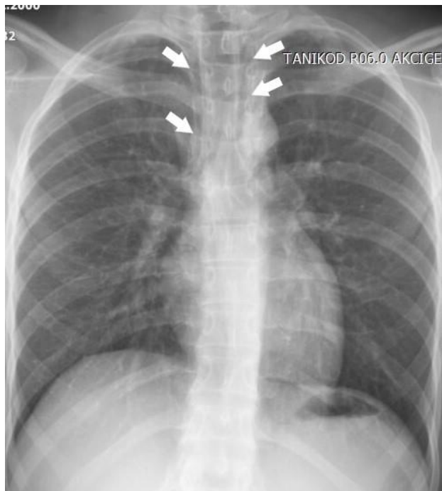
Figure 1: View of free air as a linear band in the paratracheal area in the mediastinum (white arrow).

The patient was consulted to the department of thoracic the preliminary surgery with diagnosis pneumomediastinum, and he was admitted to the thoracic surgery ward for follow-up and treatment. Only analgesics were given for the treatment of chest pain. Complaints of the patients regressed the follow-up, pneumomediastinum areas regressed in radiographs, and the patient was discharged on the third day of hospitalization. Written informed consent was obtained from the patient for publication of this case report