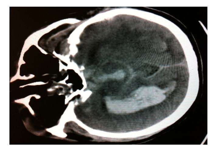
Fig. 3. Subarachnoid hemorrhage in cranial tomography.

Recent studies show a time period of 90 minutes for decompression to return to the previous visual acuity (Hislop