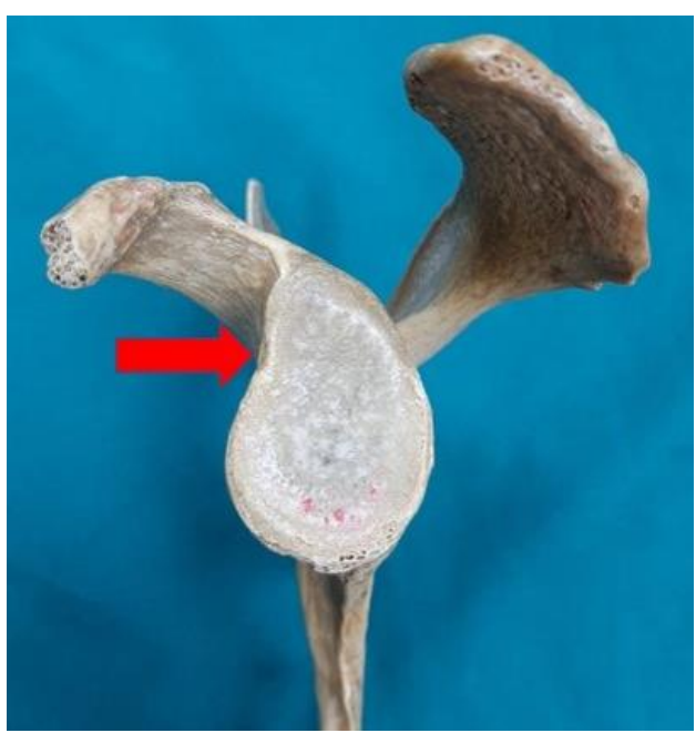
Figure 3. Pear shaped glenoid cavity with a notch, the red arrow indicates the indistinct notch

All of the inverted comma shaped GC had a distinct glenoid notch. All of the oval shaped GC had no glenoid notch. The glenoid notch was found at the right side, left side, and all of the pear-shaped GC; 26 (41.3%), 17 (34.7%), and 43 (38.4%), respectively (Figure 3). No glenoid notch was found at the right side, left side, and all of the pear-shaped GC; 37 (58.7%), 32 (65.3%), and 69 (61.6%), respectively (Figure 4). No significant difference was found between the right and left sides for the notch formation of pear shaped GCs (p=0.478). The shape and notch morphology of the GC were summarized in Table 1 and Table 2.