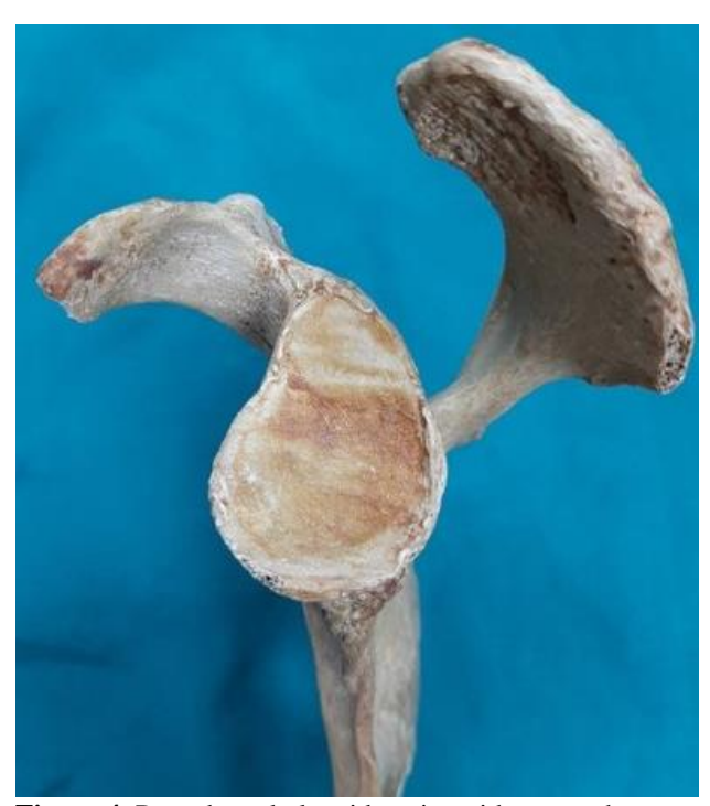
Figure 4. Pear shaped glenoid cavity with no notch