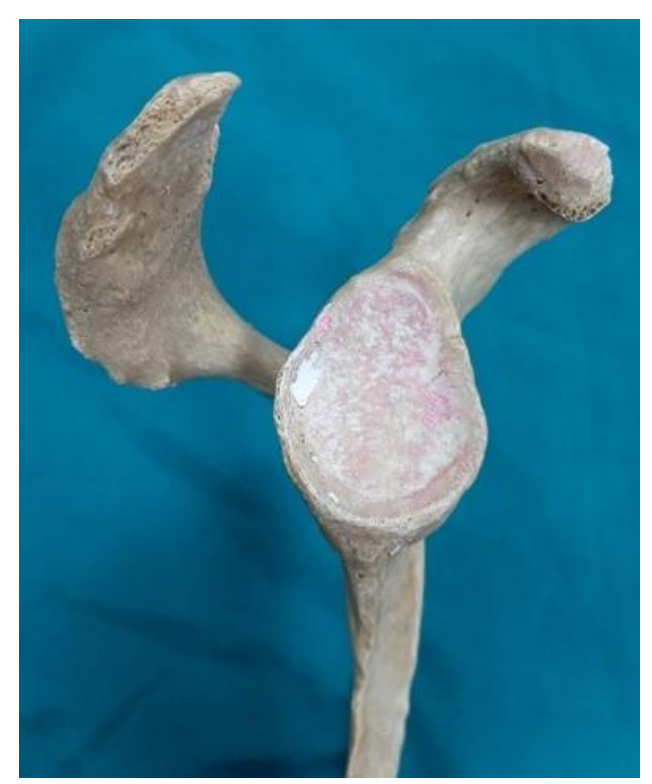
Figure 1. Oval shaped glenoid cavity

The most common GC shape was found as the pear shaped with 63 (80.8%) at the right side, 49 (62%) at the left side, and 112 (71.4%) in total. The second most common GC shape was found as oval shaped with 13 (16.6%) at the right side, 28 (35.5%) at the left side, and 41 (26.1%) in total (Figure 1). The least common GC shape was found as inverted comma shaped with 2 (2.6%) at the right side, 2 (2.5%) at the left side, and 4 (2.5%) in total (Figure 2). There was a statistically significant difference between the sides in terms of the shape of the GC (p=0.023). Post-hoc procedures and Bonferroni correction for the significance