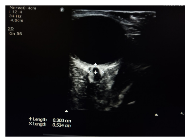
Imge 1: The diameter of the ONSD was measured 3 mm behind the optic disc using an electronic caliper

ONSD measurements were taken from the area between the hyperechoic dural sheaths located at the edge of the hypoechoic subarachnoid area surrounding the optic nerve. The image with the most suitable contrast was identified, then the image was frozen and the diameter of the ONSD was measured 3 mm behind the optic disc using an electronic caliper in both eyes and the mean value was used in the analysis (Image 1). After the measurement was finished, the gel applied to the eyelid was wiped with a clean napkin. The ONSD measurements were taken by a single anesthesiologist, 4 times in total throughout the surgery; prior to PNP (baseline, T1), during insufflation at 5 minutes (supine, T2) and 30 minutes (reverse-Trendelenburg, T3), and after deflation of PNP (supine, T4). The pneumoperitoneum was main-