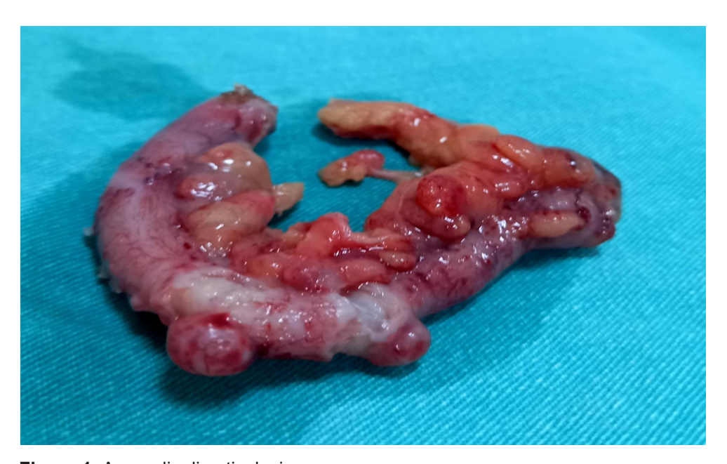
Figure 1. Appendix diverticulosis

lower quadrant pain and vomiting and nausea. Abdominal tenderness, rebound, and defense reactions were observed on his abdominal examination. The patient's White Blood Cell (WBC): 15.000 10<sup>3</sup>/uL, and C-Reactive Protein (CRP): 22 mg/L have resulted in his laboratory tests. Abdominal ultrasonography was performed and appendix diameter was measured at 8 mm, and inflammation signs were observed in the surrounding tissue in favor of acute appendicitis. Therefore, appendectomy operation planned with a preliminary diagnosis of acute appendicitis, and the patient was informed, and hospitalized. A laparoscopic appendectomy was performed. During the operation, the appendix was observed as erected hypervascularized and inflamed, and surrounded with omental tissue adhesions. After the omental adhesions were dissected with surgical instruments, three small herniated tissue was observed on the anti-mesenteric surface of the appendix (Figure 1). Appendectomy was performed properly without any complications and the patient was discharged on postoperative day 1. In the histopathological examination, acute phlegmonous appendicitis and numerous diverticulum structures were observed on the mesenteric and anti - mesenteric surfaces of the appendix wall. The diverticula structures were defined as pseudodiverticula due to mucosa and submucosa layers extending beyond the muscularis propria, without containing muscularis propria layers (Figure 2).