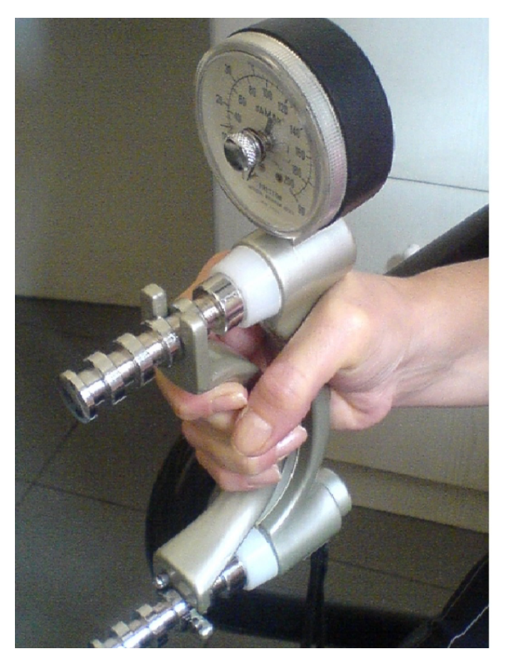
Figure 1. Photograph showing hand grip strength measurement with Jamar dynamometer.

The patient group consisted of 36 hands of 18 participants previously diagnosed with EMG as CTS. In the physical examination, none of the patients in the CTS group had thenar atrophy. The control group was formed of 60 hands of 30 healthy volunteers and 5 hands detected as normal on EMG from the CTS patient group. For each hand, hand grip strength was measured with a Jamar dynamometer (Lafayette instrument, USA, 2004) in kilograms. To standardize the results, the hand grip strength test was conducted in the same position for each patient (shoulder in full adduction and elbow at 90°) (Figure 1).