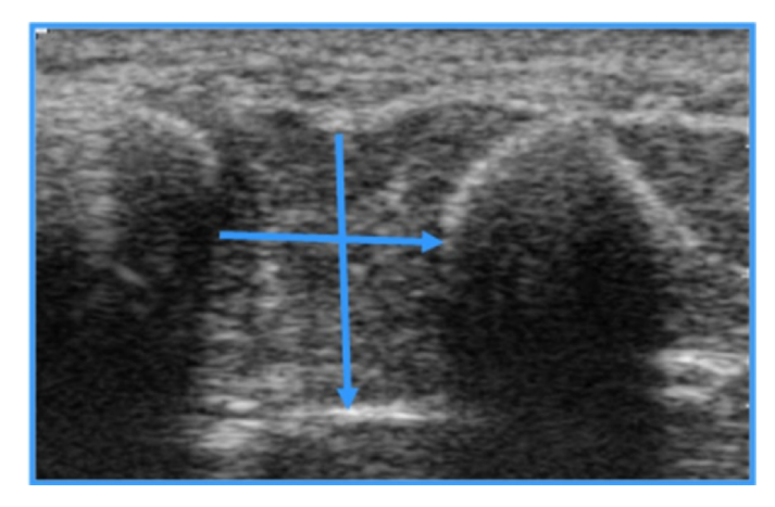
Figure 4. Intermetacarpal space, area between arrows.

measurements were made on the radial aspect of the lumbrical muscle planes (Figure 4). For each region, 3 vertical measurements were taken in the anteroposterior and transverse planes and the mean values for each were recorded.