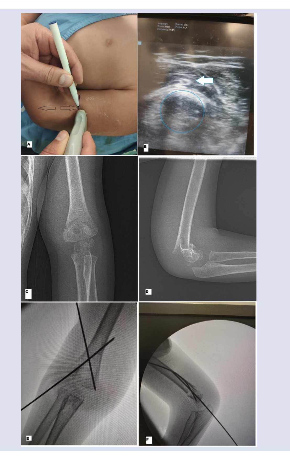
Fig. 1. Supracondylar humerus fracture in a 5-year-old girl. A. Using ultrasonography, the place where the radial nerve crosses the humerus is determined (black arrows: safe zone). B. Ultrasonogram of the patient (white arrow: radial nerve, blue circle: humerus). C. Preoperative AP X-ray image. D. Preoperative lateral X-ray image. E. Intraoperative AP fluoroscopy image. F. Intraoperative lateral fluoroscopy image.