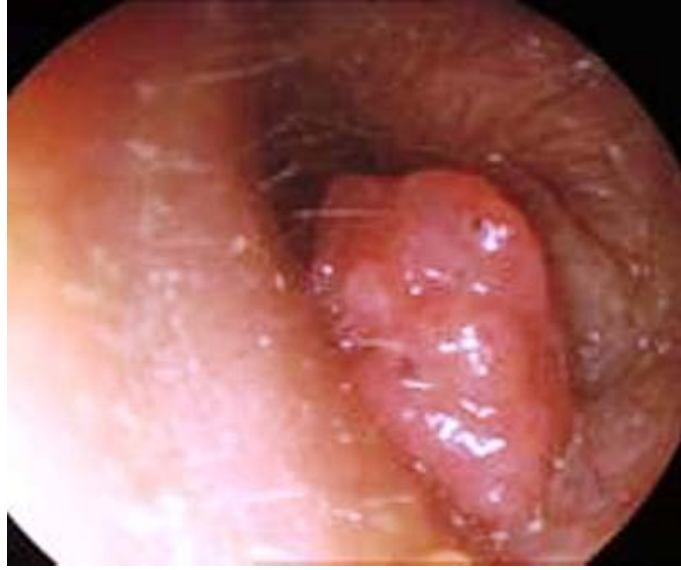
Figure 1. A mass on the right external ear tract which had a papillomatous appearance, obliterated the canal and was visible from outside was identified.