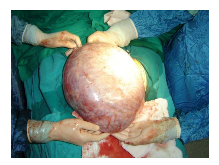
Figure 1. Macroscopic appearance of the cyst during operation.

Macroscopically, the intact cyst was multiloculated weighing 6000 g and 38x30x28 cm in size. It was filled with 5.5 L of mucous fluid content. The external surface of the cyst was smooth and pinkish, however inner surface contained multiple trabeculae, but no solid component or hemorrhagic areas were seen. Microscopically, the cyst was lined by a single layer of columnar epithelia including goblet cells in some areas. Papillary projections containing eosinophilic secretions were observed on the surface. Luteal