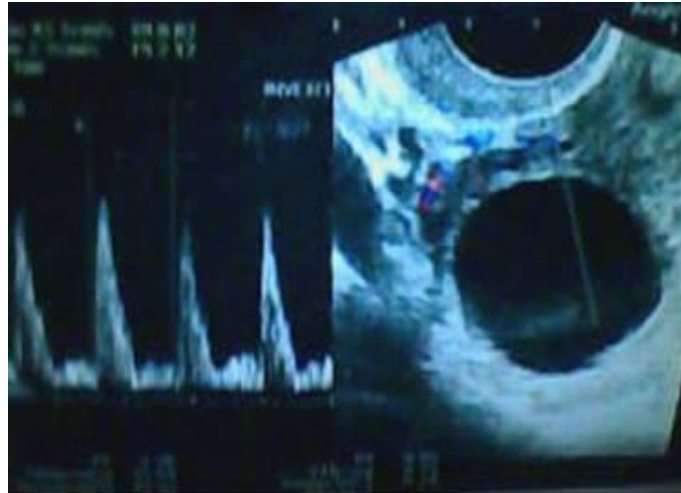
Figure 1. In the right ovary within the mass, flow signals were decreased in color Doppler sonography

Transabdominal ultrasonography visualized a fetus in utero with a gestational age of 34 weeks. In the right lower abdomen, an amorphous, predominantly hyperechogenic mass of 8x4x4 cm was found. The left ovary had a normal size and appearance. In the right ovary within the mass, flow signals were decreased in color Doppler ultrasonography, whereas the left ovary showed a normal flow pattern (Figure 1)