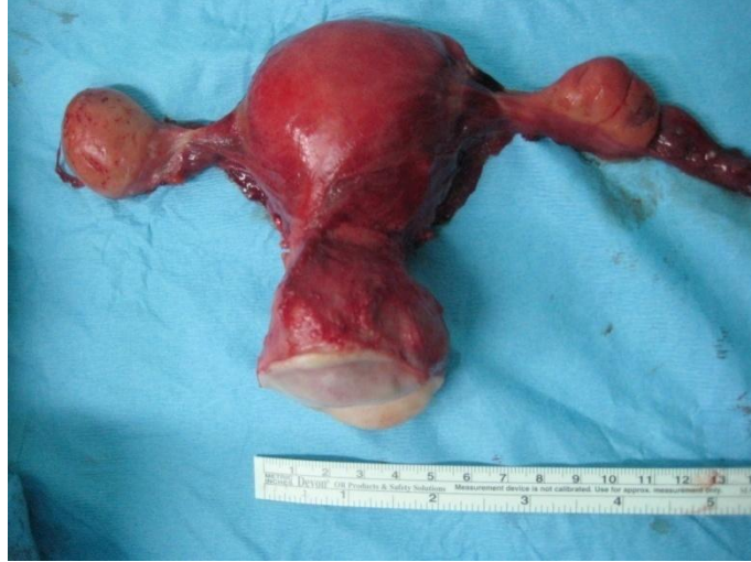
Figure 1. Macroscopic appearance of enlarged cervix.

A 49-year-old woman, G 17, P 3, A 3, DyC 10 and a previous ectopic pregnancy was admitted to our clinic with a chronic pelvic pain, fullness feeling in the vagina and irregular menstruation. In her past medical history, there was a left salpingectomy because of the ectopic pregnancy. General examination of the patient showed no abnormalities. The speculum examination revealed a multiparous enlarged cervix with an appearance of chronic cervicitis and mucoid discharge (Figure 1).