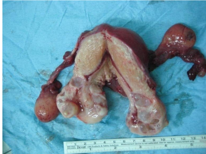
Figure 3. Macroscopic examination of uterus with multiple large Nabothian cysts.