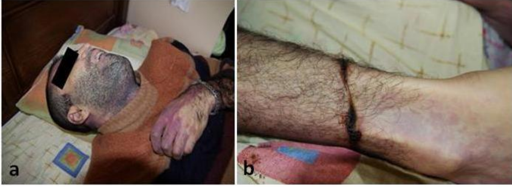
Figure 2. The copper cord between these connections was wrapped around his neck and left ankle. (a and b)