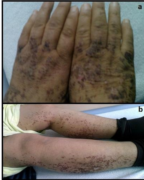
Figure 1a and b. Bilateral palpable purpuric lesions on her hands and lower extremities after the third rituximab infusion.