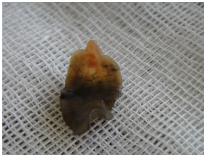
Figure 2. Fasciola hepatica in vitro.

The endoscopic retrograde cholangiopancreatography showed that the common bile duct was 10mm and an image of 8mm wide, consistent with a stone was present in the distal edge of the common bile duct. Sphincterotomy was performed and alive fasciola hepatica parasite was fell into the duodenum. It was retrieved from the duodenum with a basket (Figure 2). At the follow-up visit, she was well and her clinical and laboratory assessments were within normal limits.