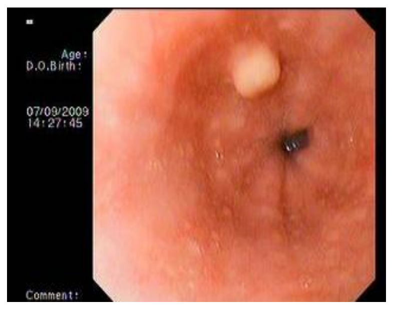
Figure 1. Uper GI endoscopy shows approximately 6-7 mm in diameter, yellowish, nodulary/polypoid lesion located in the distal esophagus, impressed into the submucosa.

In conclusion, GCT should be taken into consideration in the differential diagnosis of polypoid or small submucosal nodulary lesion which was detected in the esophagus. Small and asymptomatic lesions can be safely follow-up periodically with endoscopy, however lesions with rapid and infilrative pattern of growth and local recurrens shoul be evaluated carefully because of malign potential. Patients should be assessed about coexistence with other malign dieases.