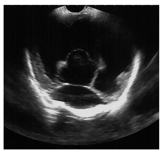
Figure 2. Cranial US show dilated and single ventricular system and cerebellar aplasia.