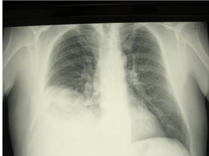
Figure 2. Posteroanterior chest X-ray revealing right lower lung atelectasis and diaphragm elevation.