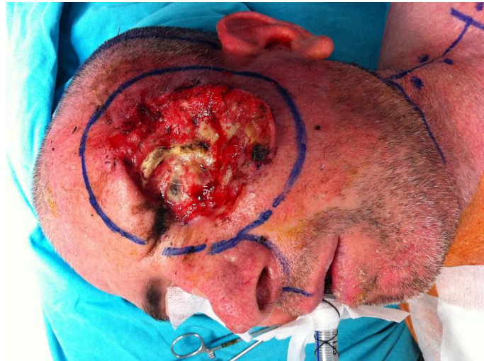
Figure 1. A complaint of a lesion that covered left eye.

A 57-years man with a smoking history of 10 years was admitted to our hospital's Plastic and Reconstructive surgery department with a complaint of a lesion that covered his left eye. Lesion was inflamed and necrotic. The patient had a surgery from his right pinna in 1999. He had noticed lesions above his right eyebrow, on his nose and on his right hand after the surgery (figure 1).