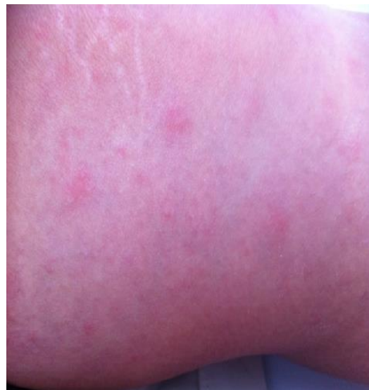
Figure 1: Vasculitic rash on the skin of the patient's left front leg.

fate, 2x200 mg/day and AZA 2x50 mg/day for vasculitis was started. In the second week of treatment, the patient's skin lesions significantly decreased and AZA dose 3x50 mg/day increased. Before this treatment, she had FMF attacks two to three times in a month (even though maximum 3 mg/day dose of colchicine). The steroid dose was decreased slowly. At six months of the treatment with colchicine 2x1/day, AZA 3x50 mg/day, and HCQ, there was no attack due to FMF.