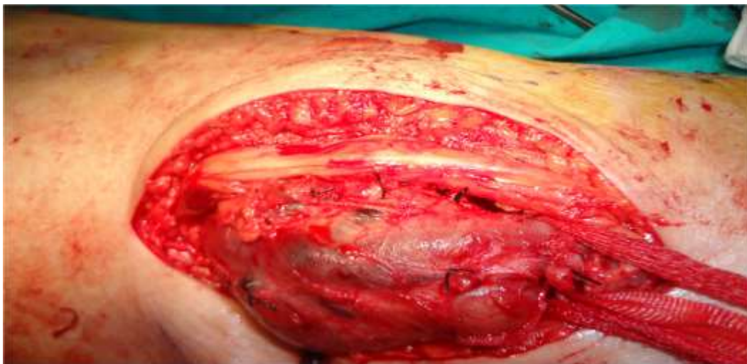
Figure 3: Intraoperative appearance before excision of the aneurysmal segment.

After liberalization of the popliteal vein, tibial and peroneal veins, aneurysmectomy was performed. On the ground that he had severe venous insufficiency and varicosity in one lower extremity and history of vascular surgery in the other, saphene vein graft could not be used and a 6 mm polytetrafluoroethylene tube graft inter-