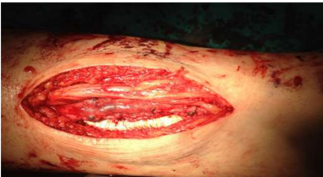
Figure 4: Appearance of polytetrafluoroethylene tube graft after excision of thrombus.

position was applied (Figure 4). After the operation, left lower extremity distal pulses were palpable (ABI=1). In the postoperative period, the patient who had complete resolution of peripheral ischemia and neuropathy complaints, was discharged uneventfully.