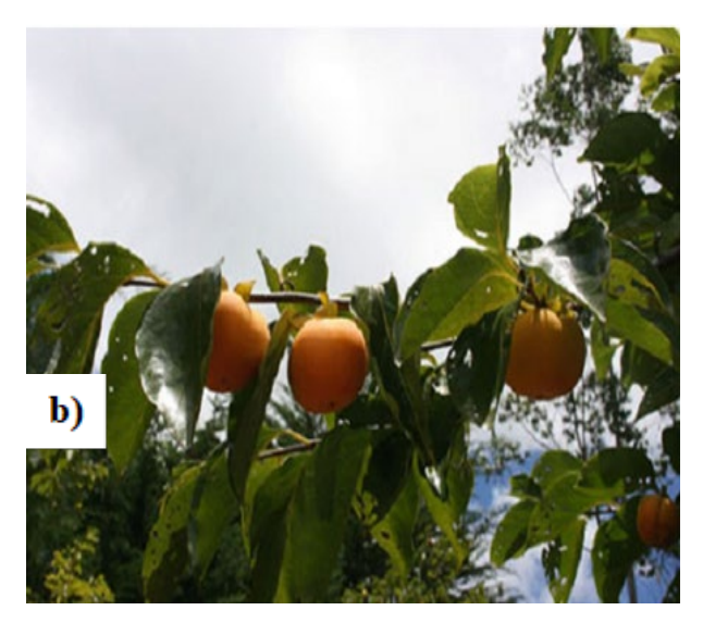
Figure 1. Ripened and unripe versions of the fruit of Persimmon a) immature form (stringent form)b) ripe form (non-stringent form)