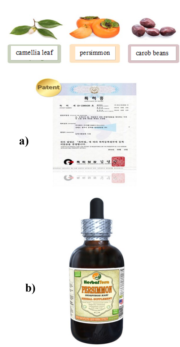
Figure 5. Some of Diospyros kaki 's existing formulations on the market a ) a patented skin soothing developed in South Korea b ) supplement food product.

The formulations of Diospyros kaki available worldwide are very limited and some of the products are shown in Figure 5. In Figure 5a, there is a patented sedative with content (camellia leaf, persimmon and carob bean) that plays a role in hair growth produced in South Korea and soothes skin irritation. In addition, in Figure 5b, acol-based/nonalcoholic extracts, teas, food supplement products and skin care products produced from plants made in Japan consisting of persimmon ( Diospyros kaki ) and dry sepals as liquid extracts. Persimmon in Turkey found in the form of that more fresh fruits and dried fruits in the market and is known to be consumed.