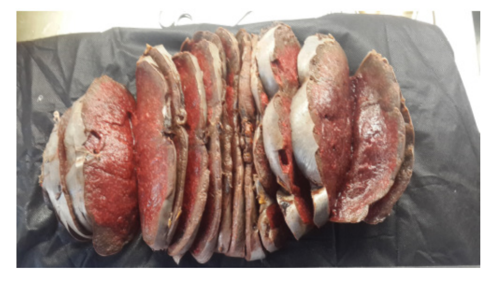
Figure 1. Splenic marginal zone lymphhoma.Gross photography of spleen showing marked expansion of the white pulp, as well as infiltration of the red pulp (H&E;×100).

nomegaly during an abdominal computed tomography (CT) scan for anemia and splenomegaly etiology. The patient was referred to the hematology polyclinic. Atypical lymphocytes were observed in the peripheral smear. There was atypical small B-lymphocyte infiltration in bone marrow aspiration and atypical small B-lymphocyte infiltration of the interstitial type in bone marrow. The results of the bone marrow biopsy and the flow cytometric studies were consistent with SMZL, so the patient was diagnosed with chronic B-lymphoproliferative neoplasm, marginal zone lymphoma involvement. A splenectomy was performed. The splenectomy material measured 28×18×9 cm and weighed 2660 g. It formed nodular structures in the cross-section and there was a gray–beige color infiltration (Figure 1).