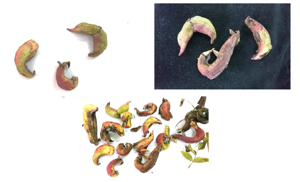
Fig 1 : Galls of Pistacia terebinthus