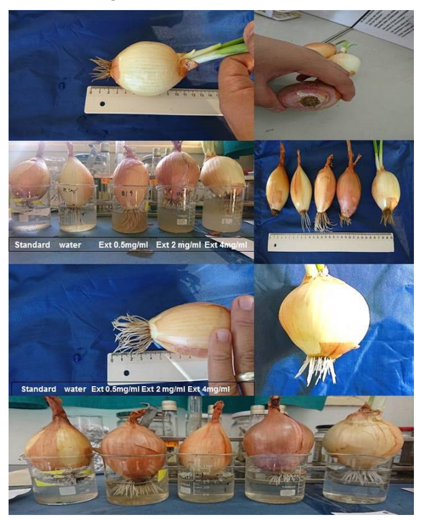
Fig 2 Antimitotic Activity after treatment of A. cepa root with different MeoH extracts of Galls