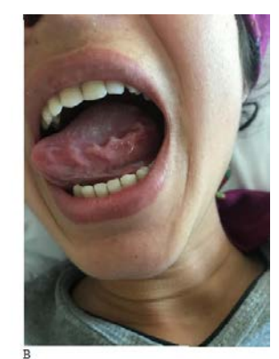
Figure 2. A-B: Mouth and tongue lesions on the 3<sup>rd</sup> day of hospitalization

Harran Üniversitesi Tıp Fakültesi Dergisi (Journal of Harran University Medical Faculty) 2021;18(2):349-352. DOI: 10.35440/hutfd.908597