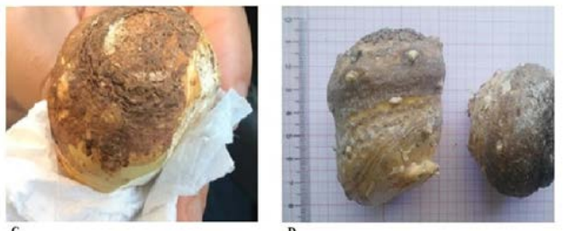
Figure 1. A-B) General view of Eminium intortum in field, C-D) Its tubers

E. intortum tuber is spherical, approximately 2.1-4.5 cm in diameter (Figure. 1). After the tuber of this plant is