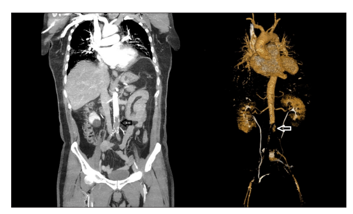
Figure 2. Infra-renal distal aortic and left iliac artery thrombotic occlusion on CT angiography, 3-dimensional reconstruction (arrows).

In the literature, as in this case, reports show a relationship between a coronavirus infection and lower limb arterial thrombosis, such as aortoiliac thrombosis. Vulliamy et al. (9) reported two patients with COVID-19 pneumonia who also had acute thrombotic occlusion of the descending aorta. Bellosta et al. (10) published a descriptive cohort study involving 20 Italian patients with acute arterial ischemia. In their study, they proposed a virus-associated hypercoagulation as a possible etiology. Klok et al. (11) reported a 31% incidence rate of arterial or venous complications in 184 COVID-19 patients in intensive care units (ICU). In this cohort, 65 with pulmonary embolism, 3 with deep venous thrombosis, 5 with ischemic strokes, and 2 with systemic arterial thromboembolism were reported. Perini and colleagues reported 4 COVID-19 patients who had acute limb ischemia (ALI) symptoms. Two of these patients had no previously known underlying health conditions or risk factors. One of these patients was a 53-year-old male who not only showed symptoms of ALI but also signs of acute aortoiliac occlusion. This patient underwent an open thrombectomy but on the second postoperative day the patient died (12).