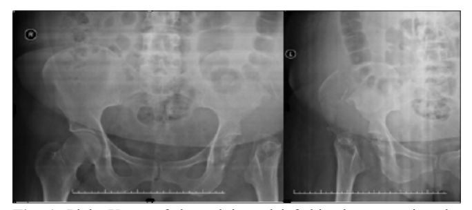
Fig. 1. Plain X-ray of the pelvis and left hip demonstrating the fractures of the iliac wing and femur neck.

A 43-year-old female patient presented to Emergency Department due to pain on hip and difficulty in walking after hitting a heater-stove 3 days ago. She had a history of anemia. On the physical examination, left leg movements were painful and limited. There was an ecimotic area of 3×6 cm on the left iliac wing reaching to lateral femur and abdomen. Examination of other systems and vital findings were normal. Laboratory findings were as follows: glucose; 155 mg/dl, AST; 70 U/L, ALT; 80U/L, Hgb; 8.8 g/dL, Hct; 27.8%. Coagulation tests were normal. An abdominal ultrasound was performed and was normal. A plain pelvis and hip radiography was performed in order to determine a possible fracture. On X-ray, a fracture on left iliac wing and neck of femur was determined, but it was difficult to determine the location of the displaced head of femur (Fig. 1).