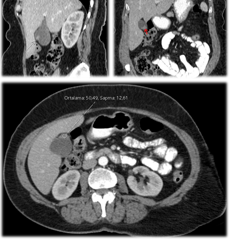
Figure 1(a)(b)(c): Images of the case on CT.

Histologically, the polypoid lesion consisted of gastric mucosa composed of fundic and pyloric glands. Other gallbladder mucosa demonstrated pyloric metaplasia and chronic cholecystitis findings.