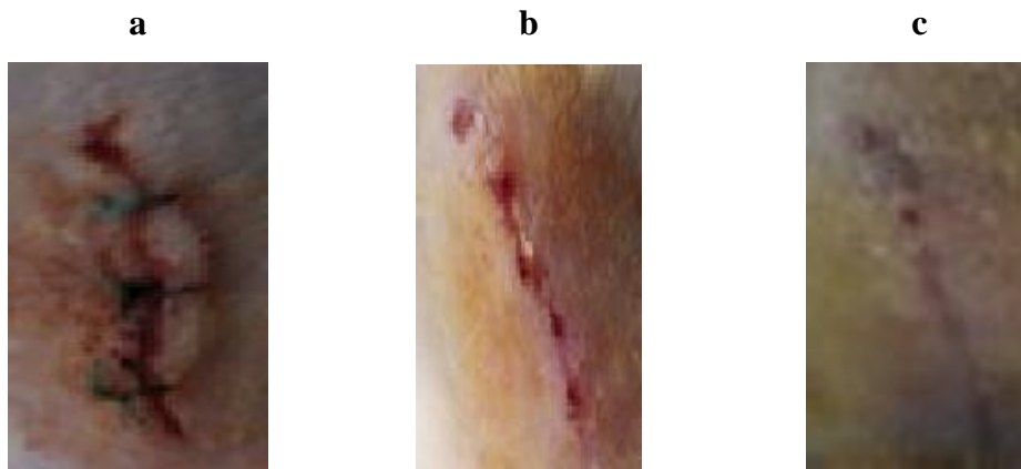
Figure 1. Photos from wound areas of control group (photos were taken on the 1 st -7 th -14 th days respectively).