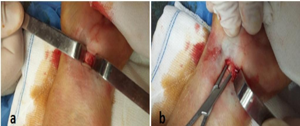
Figure 2. The edges of the incision were separated by two retractors (a) and carpal ligament were cut with scissor.

blunt dissection, and then proximal and distal parts of the ligament were cut with scissors to release the median nerve (Figure 2).