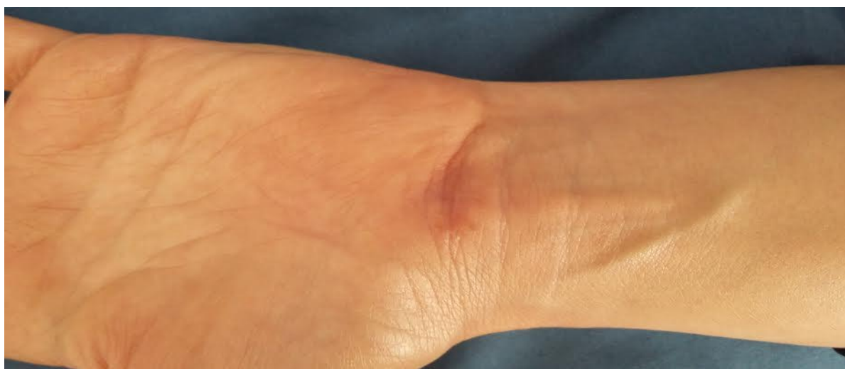
Figure 4. Excellent cosmetic appearance was achieved with mini incision median nerve release. The incision scar is hardly visible since it is superimposed to the distal flexion crease.

There had been no complications during the operations such as bleeding or nerve injury. The mean follow-up period was 3 months. There were no operation-related complications such as skin infection and palmar tenderness. The mean pre-operation VAS score for pain was 7.8 which decreased to 2.6 post-operatively. Regarding the scar hypersensitivity and cosmetic results, the mean VAPSS score was 8.5 during the follow-up period (Figure 4). 10 patients had temporary paresthesia and no patients were re-operated.