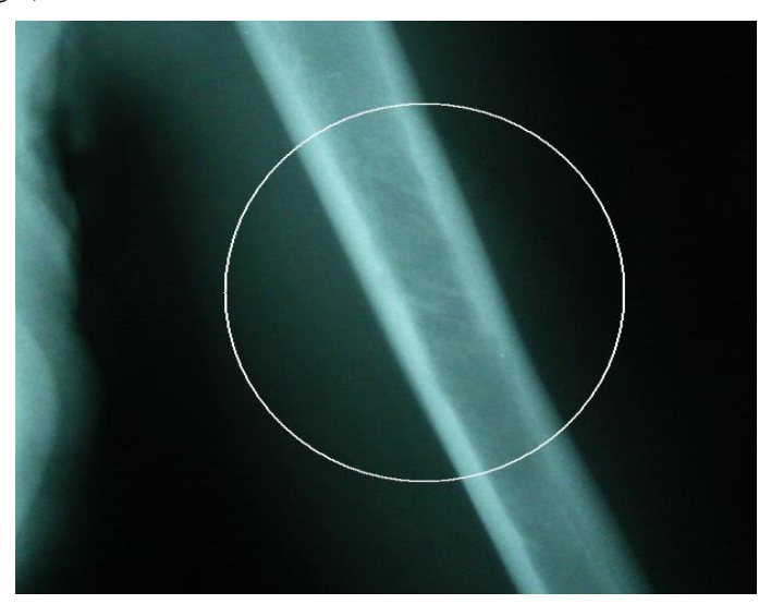
Figure 1. X-Ray; A cystic appearance located in the center of bone in the humerus radiography

A 23 year-old woman, presented to the physical treatment and rehabilitation department with a pain that was often felt over the front of the left shoulder over 3-4 months duration, with recent exacerbation of pain. There was no trauma that may cause a pain and the applicant did not have any other medical problem. Shoulder movements enhanced the pain. On physical examination, there was no skin abnormality, swelling or a palpable mass on the left upper limb. Her provocative tests (Hawkins and Neer signs) were positive for impingement syndrome of the left shoulder. The humerus was tender with palpation from proximal to middle on the left arm. There was not any limitations regarding shoulder and elbow movements. Neurological examination was within normal limits. The patient was referred for a radiological examination. Shoulder radiographs were normal. There was a cystic appearance located in the center of bone in the humerus radiograph (Fig 1).