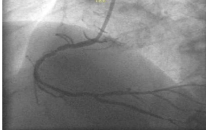
Figure 3. Successful reperfusion with TIMI 3 distal flow.