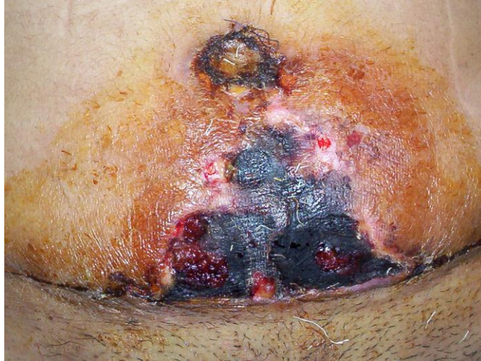
Figure 3. Abdominal flap necrosis involved both skin and fat tissue on the 20th day after surgery.

In the follow-up examinations, wound care, antibiotic treatment, and debridement of the necrotic tissues under local anesthesia were performed during 6 months. Finally wound closed itself, leaving significant lower abdominal scar which needed a major revisional surgery (Figure 4).