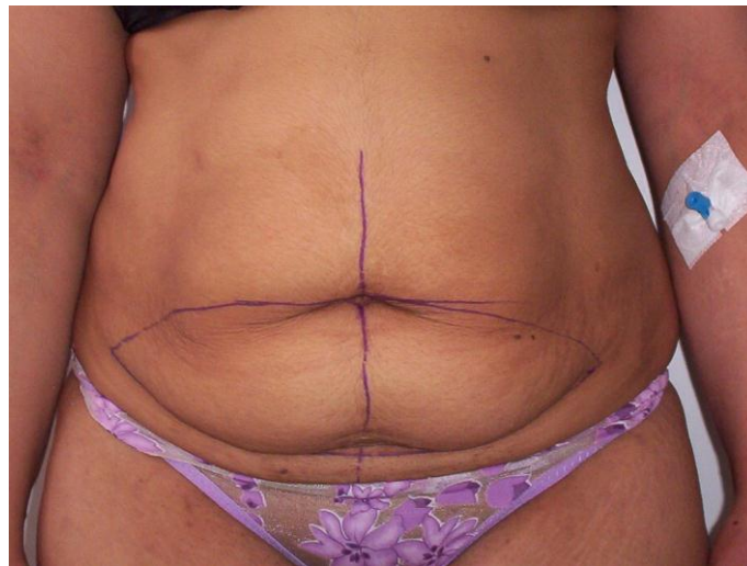
Figure 1. Preoperative view of the patient with abdominal deformation.

A 34-year-old woman presented to our clinic with the complaints of severe abdominal deformation and changes after her deliveries. On the examination, there were skin and fat excess, sagged abdominal wall, musculofacial laxity and umbilical deformation, needing an abdominoplasty operation to restore the abdominal shape and contour entirely (Figure 1).