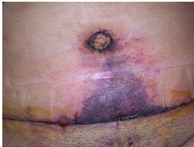
Figure 2. Two days later the operation, appearance of the ischemic findings of the abdominal flap below the neumbilicus. Note that there was not any tension in the flap at the suture line.

In the postoperative course, less pain and early recovery appeared, so she was encouraged to be as mobile as permitted by comfort, but strenuous activities and heavy lifting were restricted. After an overnight stay in the hospital the patient was discharged 48 hours after the intervention. She was again seen to change the dressing, and remove the drains when their outputs were less than 50 mL per day. However, ischemia of the abdominal flap lower the neumbilicus at the midline appeared, resulting in severe necrosis of the flap (Figure 2, 3).