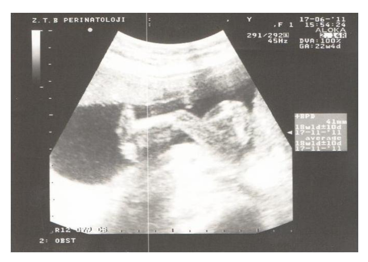
Figure 1. Fetal ultrasonographic view of fixed flexion of the lower limbs, knee and ankle.