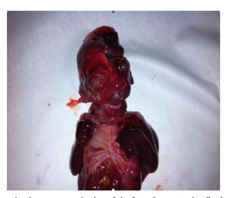
Figure 4. Posttermination macroscopic view of the fetus demonstrating fixed opened mouth, micrognathia, hypertelorism, proptosis, short neck, posteriorly rotated ears, skin anomalies, chest hypoplasia and multipl joint contractures.