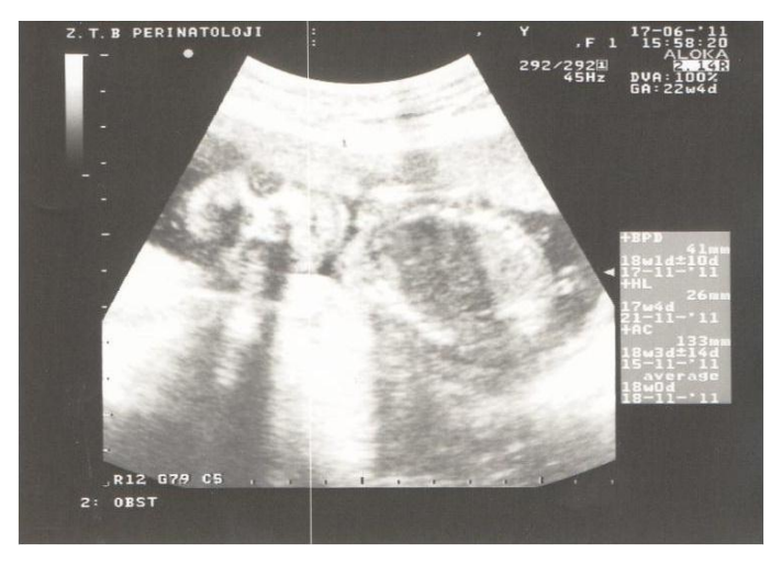
Figure 2. Fetal ultrasonographic view of fixed opened mouth, small thoracic cage and absence of gastric fluid.

These findings were consistent with the Pena Shokeir syndrome phenotype. The parents were informed about the diagnosis and its poor prognosis. Fetus had no viability, therefore, the termination of pregnancy was offered to the parents and they accepted.