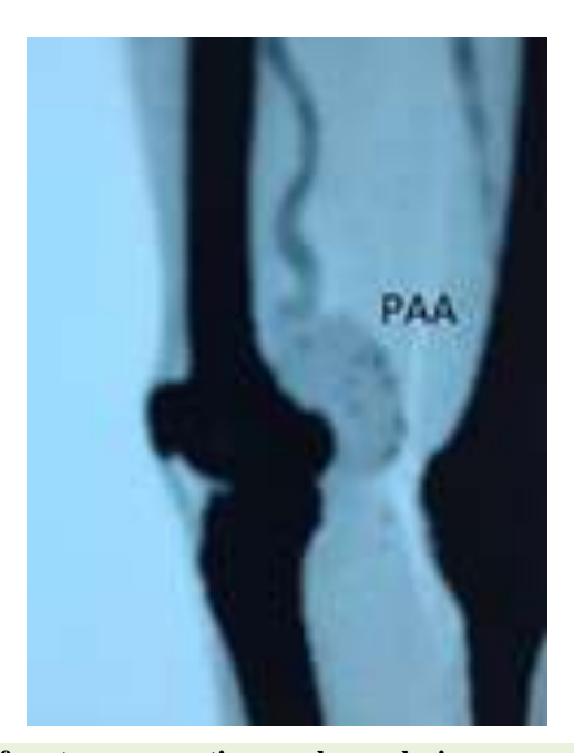
Figure 2: Appearance of postaneurysmatic vascular occlusion.

The patient was taken to operation room under emergency conditions and spinal anesthesia was performed. In operation, via posterior approach and performing incision to the output of hunter channel, superficial femoral artery was suspended. Then the popliteal artery was suspended