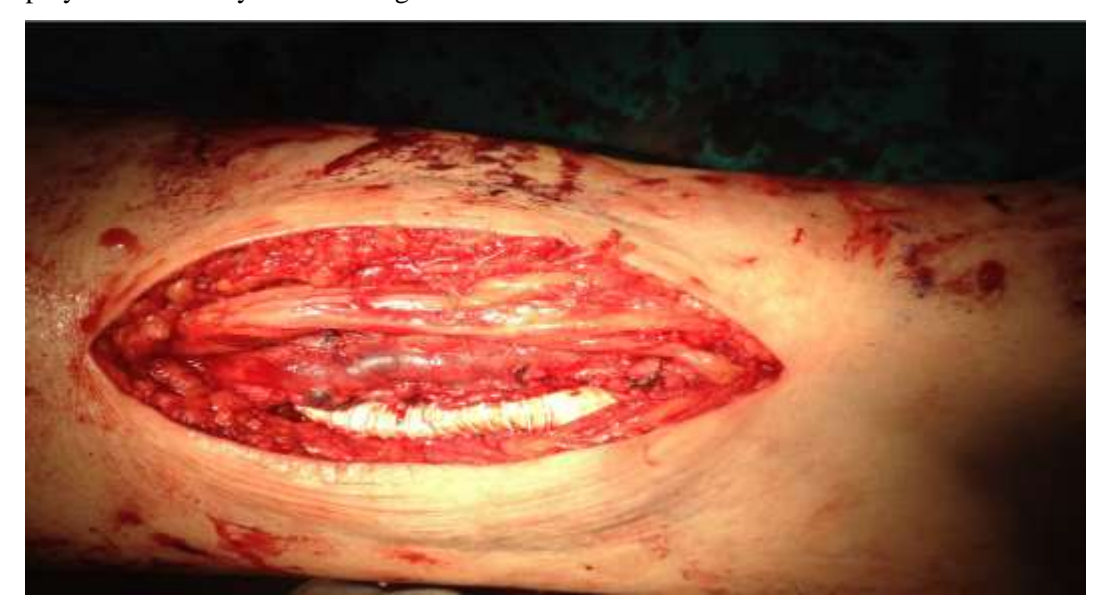
Figure 4: Appearance of polytetrafluoroethylene tube graft after excision of thrombus.

position was applied (Figure 4). After the operation, left lower extremity distal pulses were palpable (ABI=1). In the postoperative period, the patient who had complete resolution of peripheral ischemia and neuropathy complaints, was discharged uneventfully.