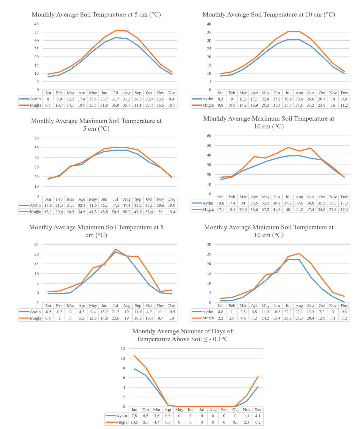
Figure 2. Monthly soil temperature values

Aydın, where IA-A samples were collected. The difference between Aydın and Muğla in terms of monthly maximum temperature values is significant during June, July, August, September and October.