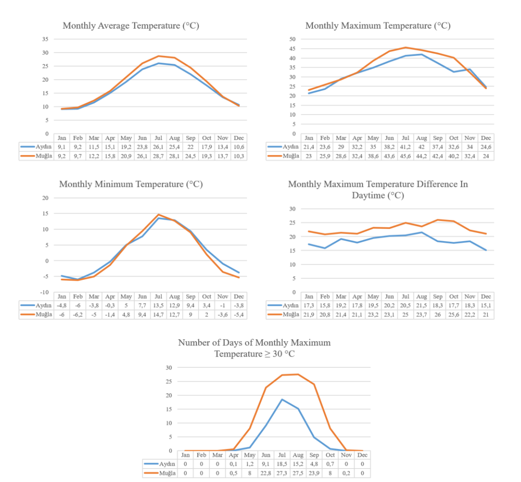
Figure 1. Monthly temperature values

If the MIC and MBC/MFC values given in Table 1 are compared it can be decided which extract has a lethal and which has a static type of activity. Since the MIC values and MBC values are the same in the BE extracts of IA-A , we can conclude that a concentration of 10 \mu L.mL<sup>-1</sup> of the extract has a lethal activity against B. subtilis . This is also true for a 5 \mu L.mL<sup>-1</sup> concentration of MeOH extract of IA-M against B. subtilis .