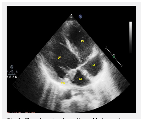
Fig. 1. Transthoracic echocardiographic image shows a large vegetation on the mitral valve (veg). RA: Right atrium, RV: Right ventricle, LA: Left atrium, LV: Left ventricle.