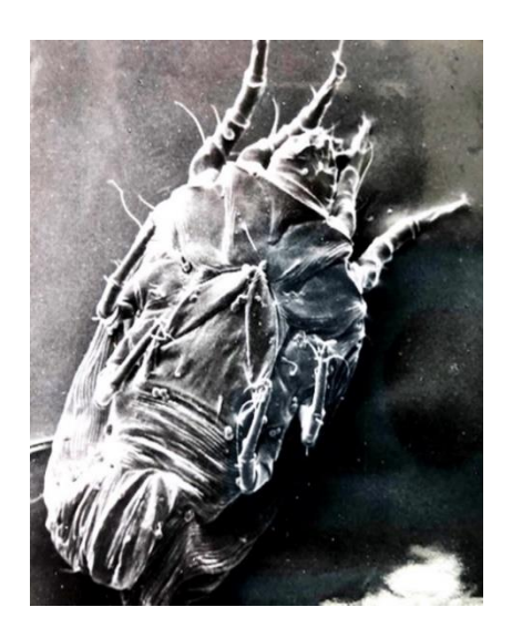
Figure 3. Euroglyphus maynei (female)

these results should be interpreted carefully due to methodological limitations. Isolated interventions such as the use of impermeable mattress covers offered little clinical benefits (Platts-Mills et al., 1989, 1997; Colloff et al., 1992; Calderon et al., 2015; Singh and Hays, 2016; Miller, 2019).